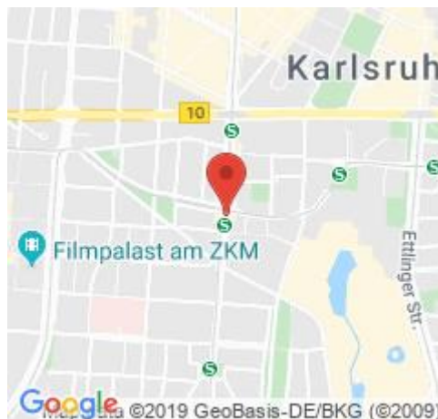
Karlstrasse 42 - 44

These Business Apartments on Karlstraße are located in the city centre of Karlsruhe, just by the Karlstor light rail station and opposite the Federal Court. From the property you can reach the Kaiserstraße, the shopping centre ECE, and the Karlsruhe Baroque Palace, as well the Badische Staatstheater, cinemas and much more. You can reach the Karlsruhe Hauptbahnhof in about 7 minutes by car. All of the 1 bedroom apartments are spacious and furnished with modern furniture, fully fitted kitchens, WiFi and flat screen TVs so you can feel at home right from the start.